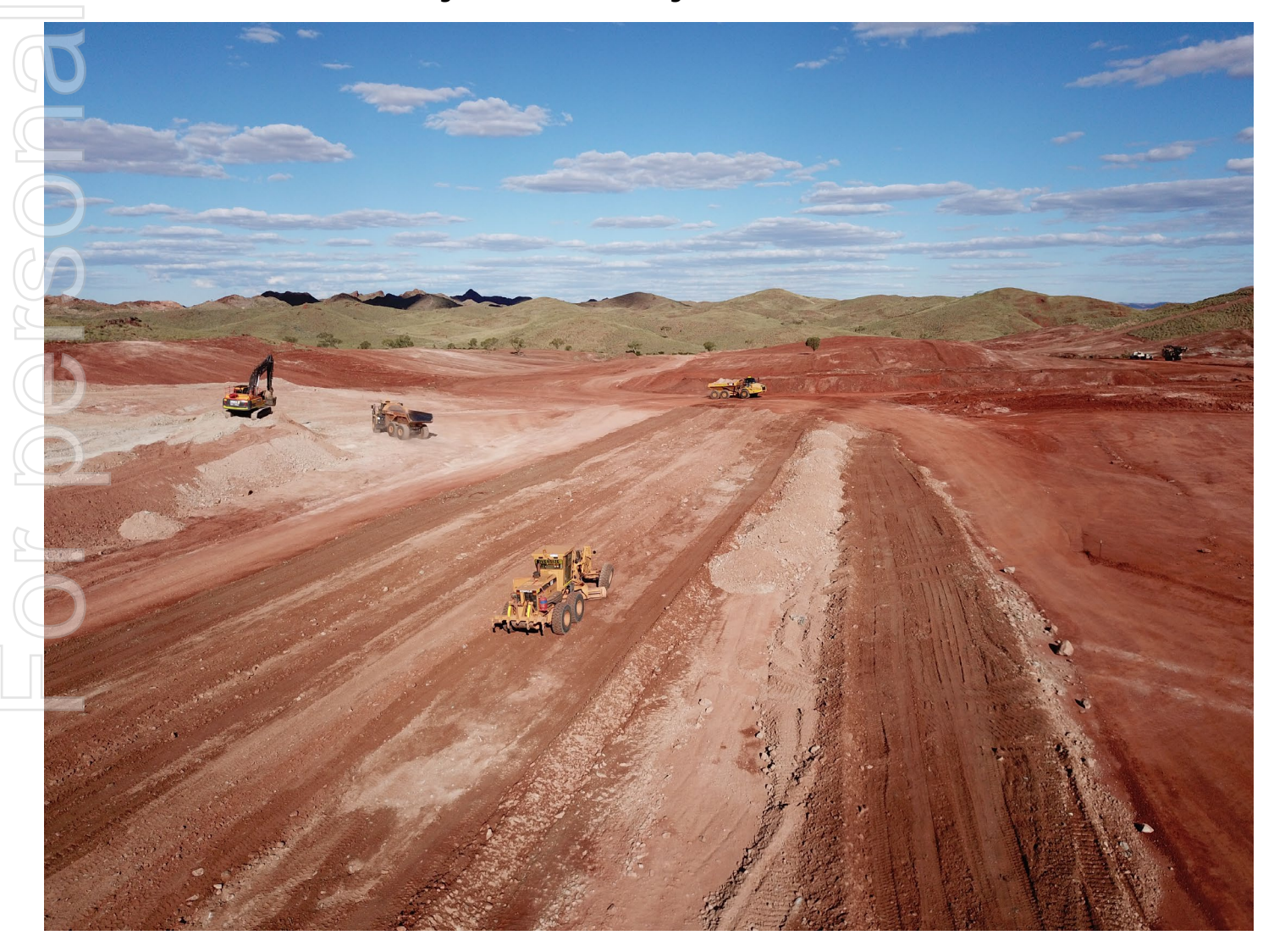
Figure 2: Bulk earthworks at process plant well underway