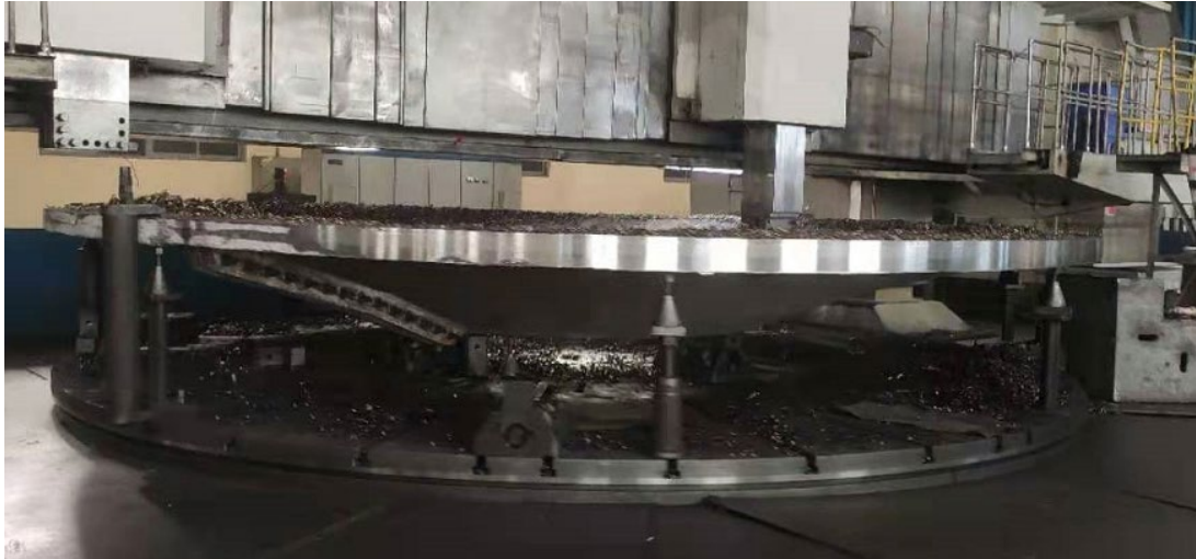
Figure 3: SAG Mill rough machining complete

This announcement has been authorised for release by the Board.